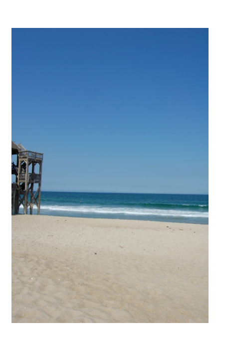
Take 4 horizontal pictures. Overlap when taking each shot